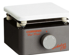
Laboratory Hot Plate