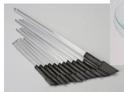
Stirring Rod + Rubber Policeman