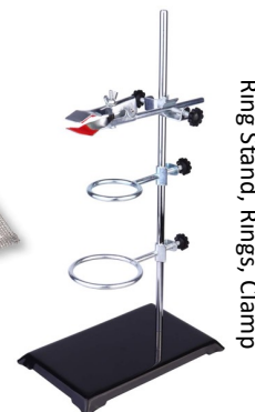
Ring Stand, Rings, Clamp