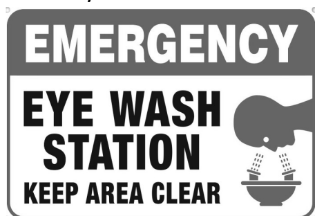
Eye Wash Station