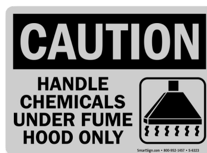
Chemical Fume Hood